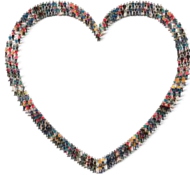
Voluntary goodwill initiatives